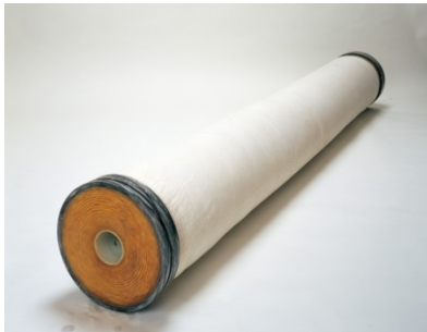
Hollow fiber forward osmosis (FO) membrane

Hollow fiber forward osmosis (FO) membranes manufactured by Toyobo Co., Ltd. have been adopted at a first of its kind osmotic power plant in Denmark. The pilot plant is operated by Danish venture firm SaltPower ApS with support from industrial machinery maker Danfoss A/S and engineering firm Semco Maritime A/S. The plant started a demonstration in September and aims to put the membrane to continuous operation.