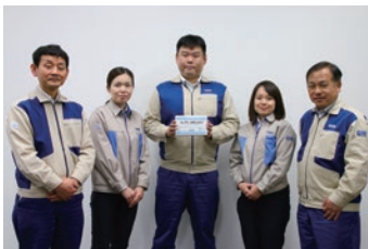
Bio-Science & Medical Research Unit, Corporate Research Center