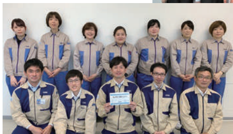
Biotechnology Research Laboratory