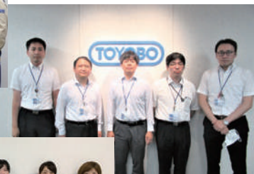
Diagnostic System Department