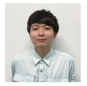
Yuichiro Matsuura Polymers Development Center Tsuruga Research and Production Center

Creating bio-based terephthalic acid has been considered difficult. While it was successfully generated using Anellotech's technology, it resulted in only a few dozen kilograms as a polymerization sample, which was much smaller quantity than anticipated. When implementing polymerization, we normally expect some failures, but with such a small amount, not even a single failure is acceptable. For this reason, after thoroughly analyzing and preparing the raw materials and equipment, respectively, the team determined the polymerization conditions after numerous discussions. The actual polymerization was repeated more than a dozen times in small quantities in order to disperse the risk and produce as much 100% bio-based PET resin as possible. However, the increased frequency requires an awareness of variations in quality. Each operation to adjust the temperature or pressure was performed carefully step by step to avoid such variations, and then fine-tuned according to differences among lots of raw materials and in the daily temperature and humidity. I remember