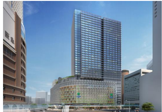
Osaka Umeda Twin Towers South