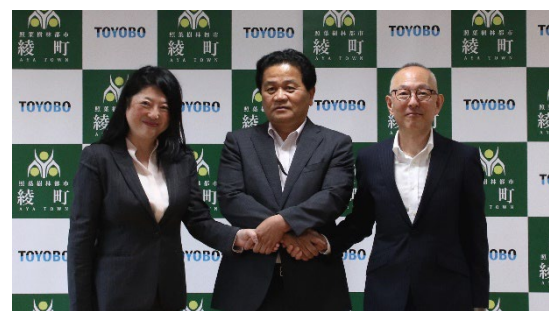
Participants of the signing ceremony