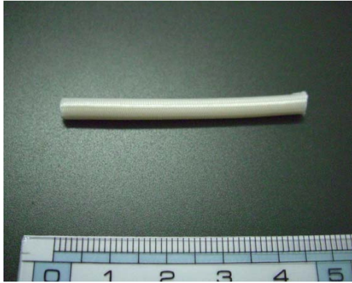
A conduit for nerve regeneration