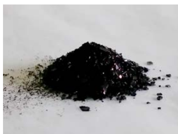
Power-generating material for OPV

OPV has attracted wide attention as a next-generation solar cell. Toyobo aims to put the material into early practical use, mainly as a wireless power source in such devices as temperature-humidity and motion sensors.