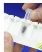
Fig. 1 Magnetic separation