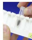
Fig. 3 Magnetic separation