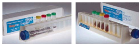
Fig.2 Magnetic stand Magical Trapper (Code No.MGS-101)